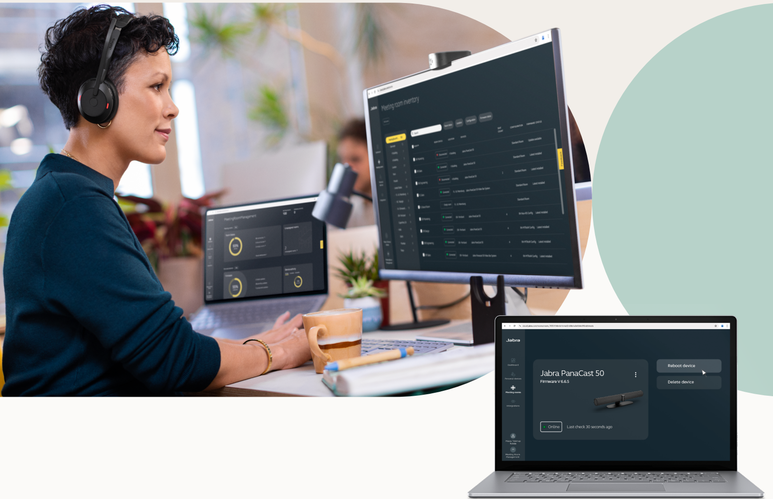
Remote reboot of device shown