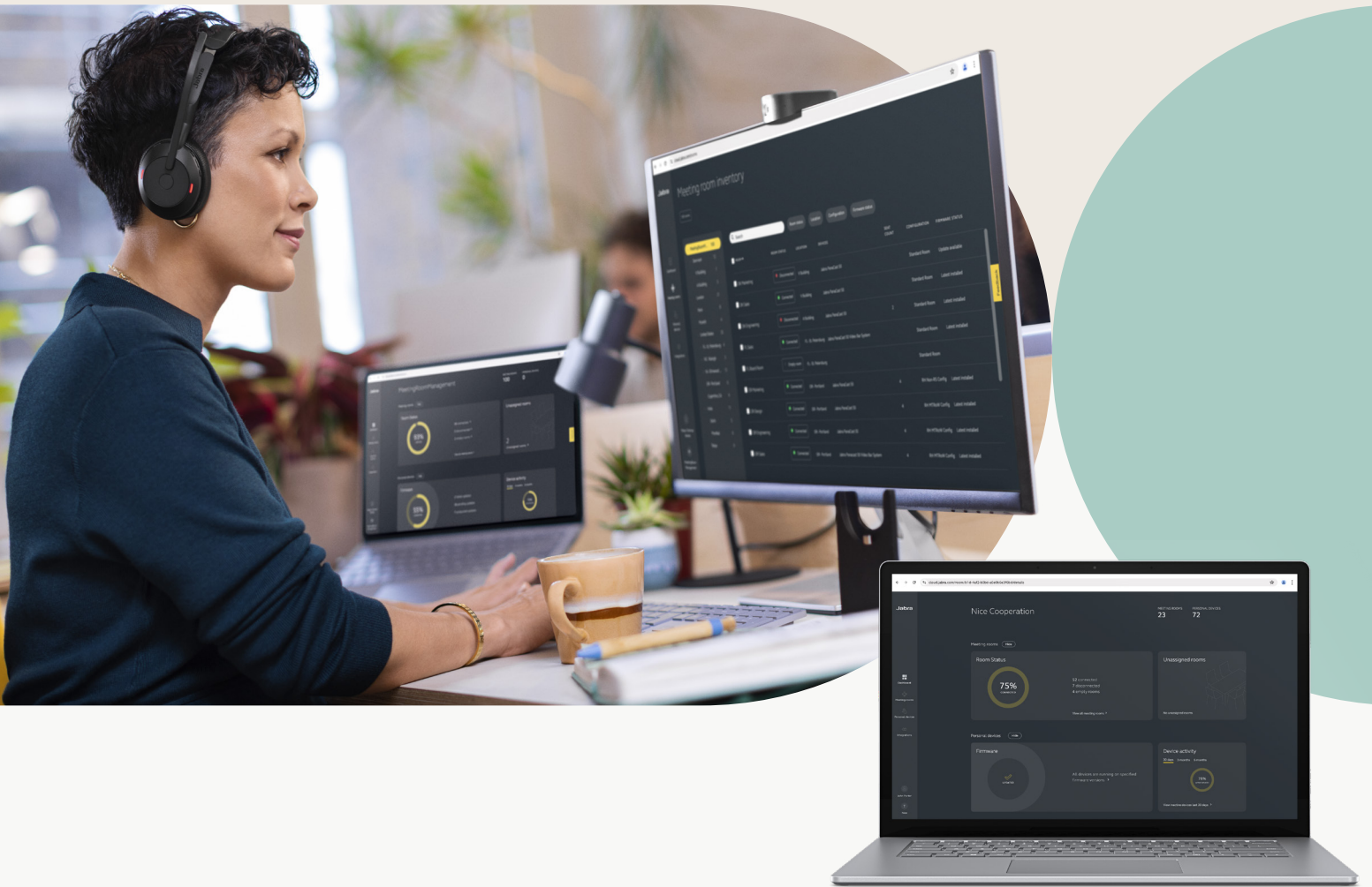
Jabra+ dashboard shown